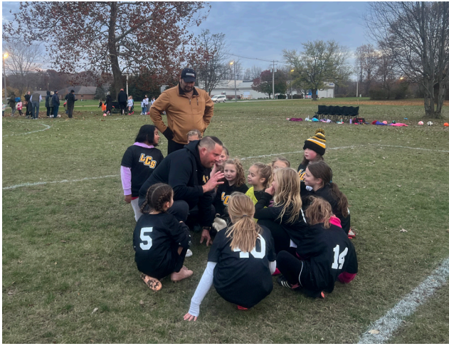
Left: Parents coach an elementary soccer team.