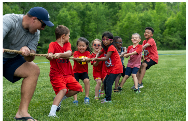
Elementary Field Day gives parents and students time to celebrate the school year and work on teamwork skills.