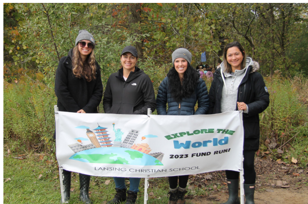
Parent volunteers set up our Fund Run course and are key to the success of this fall event.