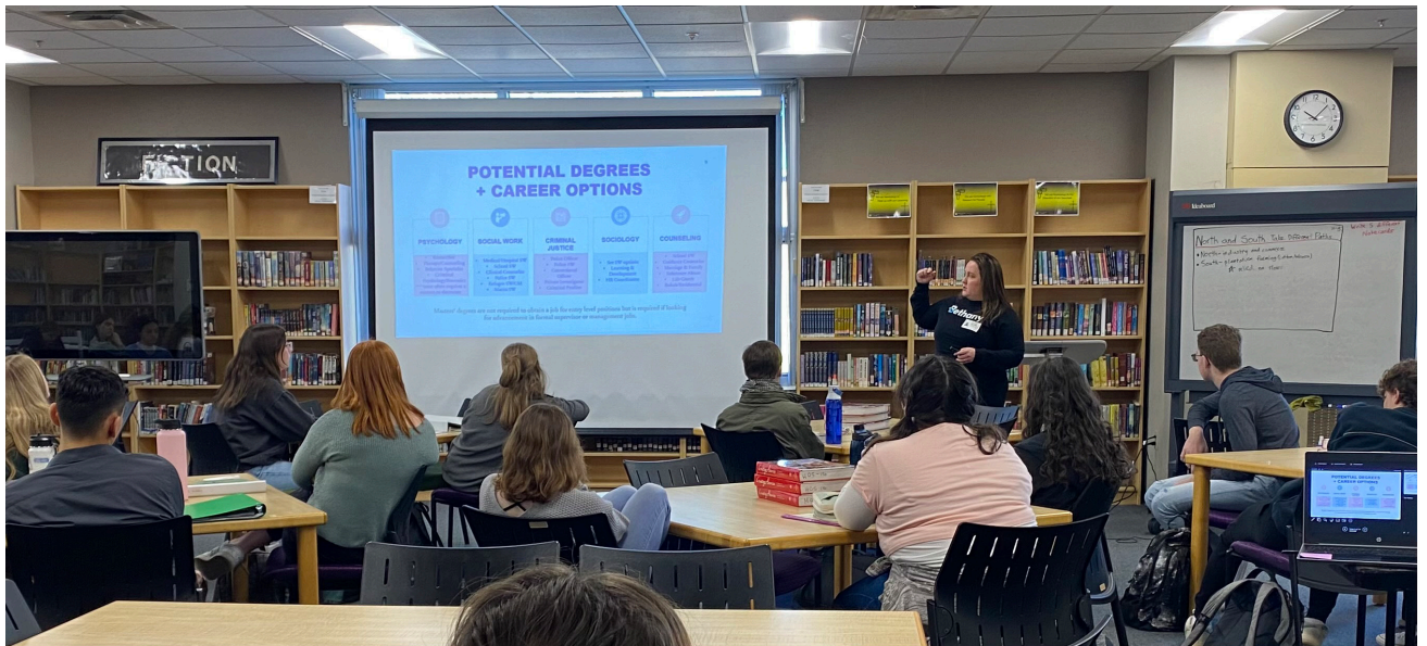
Below: Parents speak to high school students at Career Day.