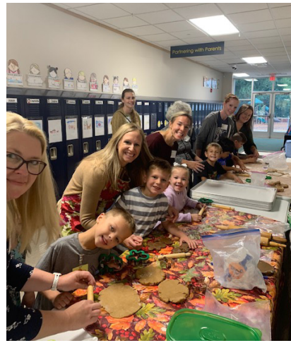
Right: Kindergarten parents help with the Thanksgiving feast.